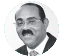
Gaston Browne Prime Minister

"This issue goes beyond a passport. We have many investors who are not looking for a passport – they are looking for a safe place to invest. That is what Antigua offers; it's one of the safest places on the planet"